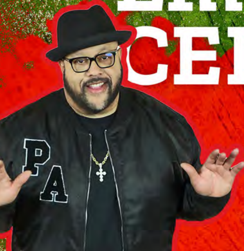
FRED HAMMOND GRAMMY AWARD-WINNING ARTIST