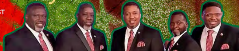
THE STINSON 5